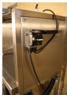
Coarse dirt filter