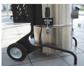
Robust tension hook