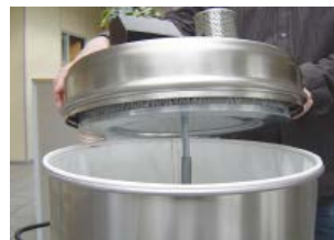
H filter easily accessible