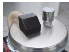
Vacuum relief valve