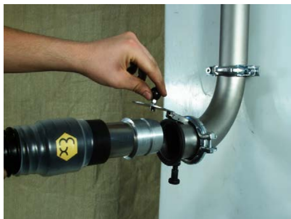
Optional control and level control

The hose connection box can be connected to a house piping without great effort. To the suction hose to connect the lid is pulled up to the box and plugged the plug. By a bolt snap the connector is fixed.